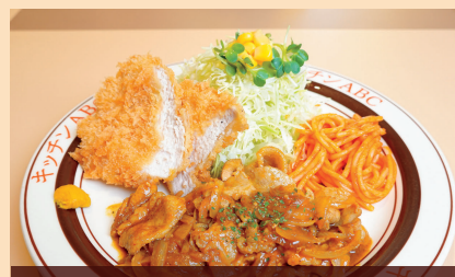
CURRY FLAVOR SET