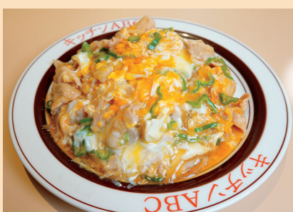
INDIAN RICE SET