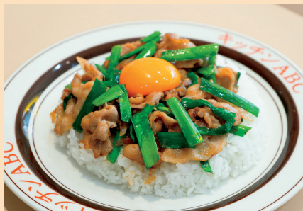
ORIENTAL RICE SET