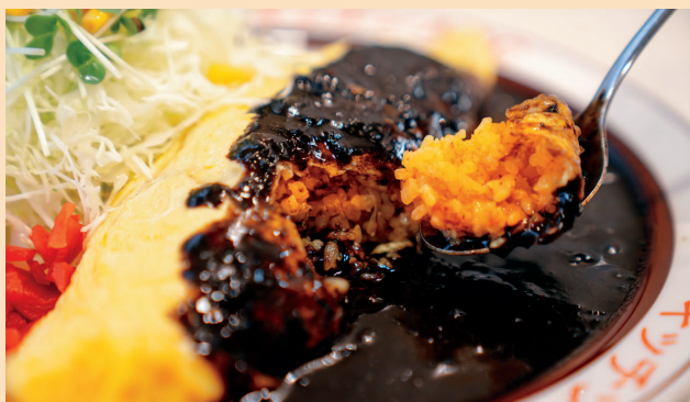
RICE OMELETTE CURRY