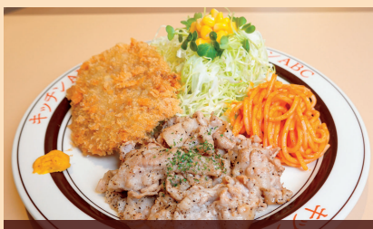
LEMON KARASHI SET