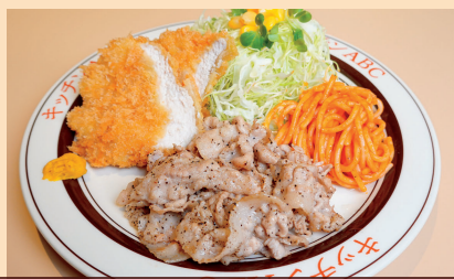
PORK KARASHI SET

ALL DISHES COME WITH A... RICE / MISO SOUP / SALAD / SPAGHETTI