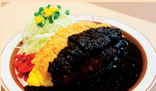
RICE OMELETTE CURRY WITH PORK CUTLET