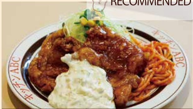
CHICKEN NAMBAN TEISHOKU 950 yen

Chicken namban is a teriyaki chicken, flavored with rich, sweet sauce. The dish was created after keen requests from our regular customers