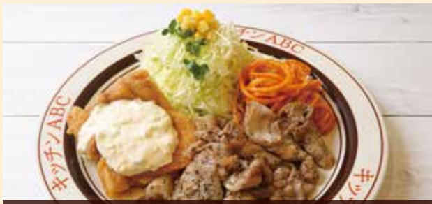
CHICKEN NAMBAN SET 1,200 yen

Chicken namban is a teriyaki chicken, flavored with rich, sweet sauce. The dish was created after keen requests from our regular customers