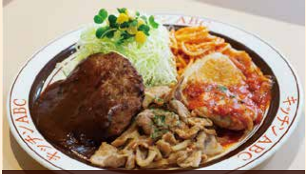
TOKUMORIA A·B·C 1,480 yen

Jumboyaki is tofu and pork stewed in miso-based sauce, topped with chopped cucumbers and green onions served with rice