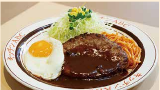
HOME-MADE HAMBURG 1,050 yen

Our traditional hamburger steaks(160g) with gravy demi-glace sauce