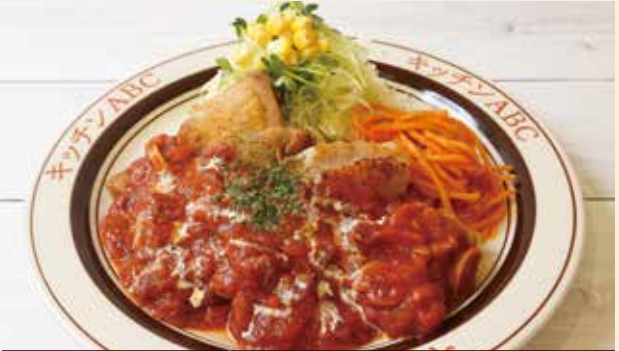
CHICKEN SAUTÉ WITH TOMATO SAUCE 1,050 yen

Our traditional hamburger steaks(160g) with gravy demi-glace sauce