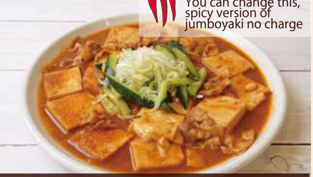
JUMBOYAKI 950 yen

Jumboyaki is tofu and pork stewed in miso-based sauce, topped with chopped cucumbers and green onions served with rice