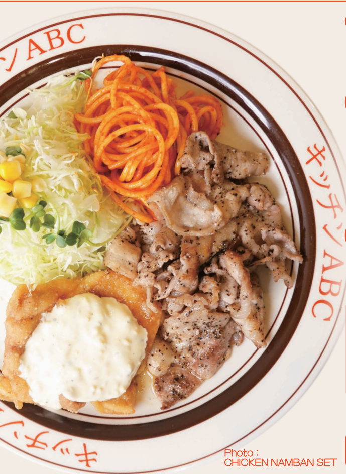
Photo : CHICKEN NAMBAN SET