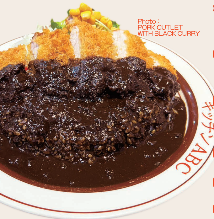
PORK CUTLET WITH BLACK CURRY