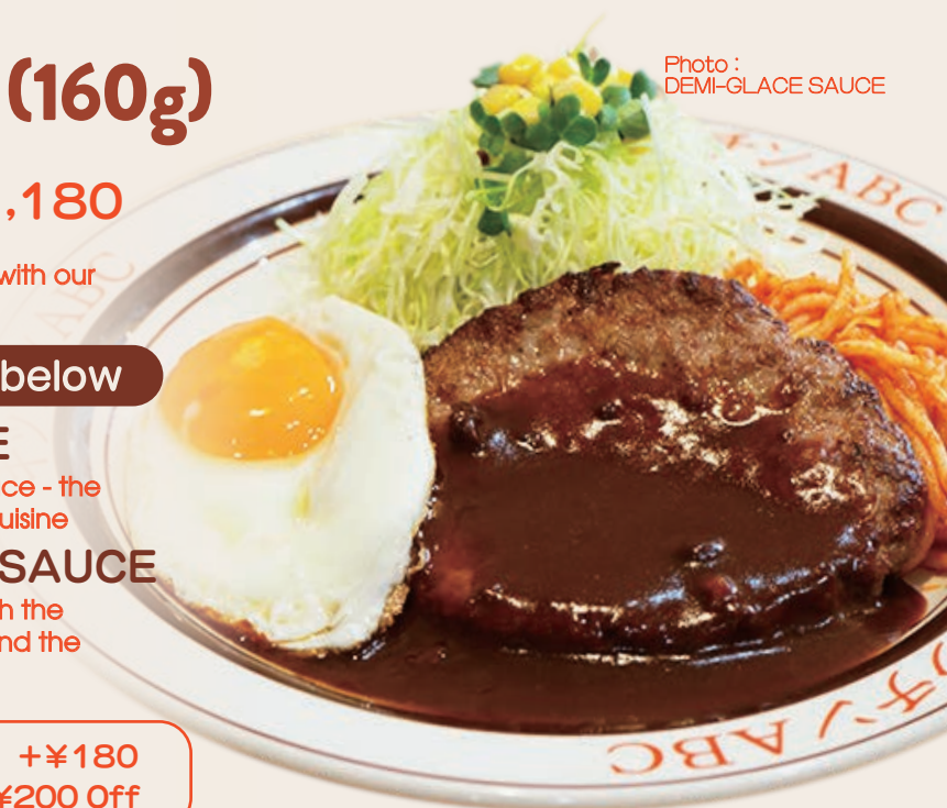
Photo : DEMI-GLACE SAUCE

Extra Rice . . . . +¥180 Without Rice & Miso Soup Get ¥200 Off