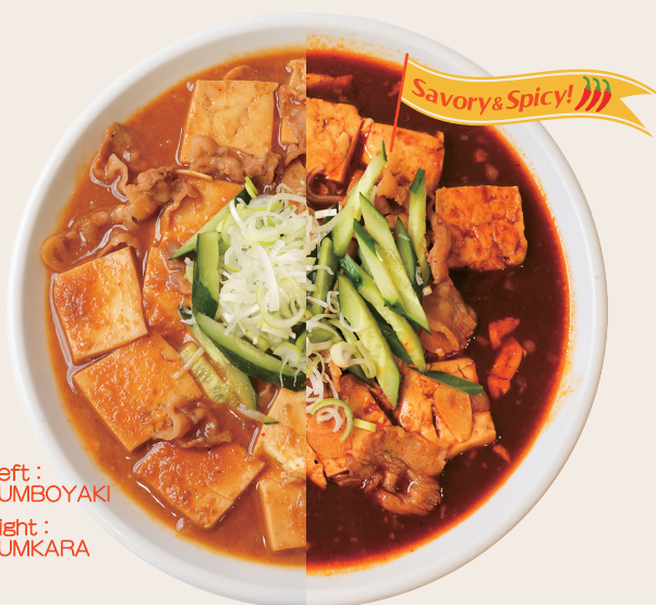
Left: JUMBOYAKI Right: JUMKARA

Extra Rice . . . . +¥180 Without Rice & Miso Soup Get ¥200 Off