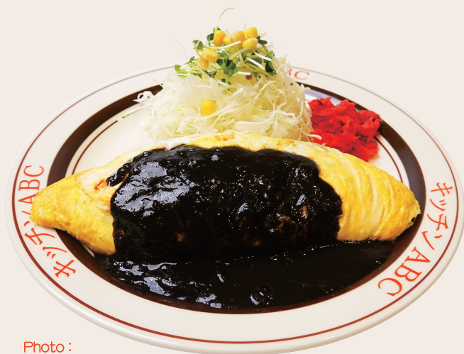
Photo: RICE OMELETTE CURRY